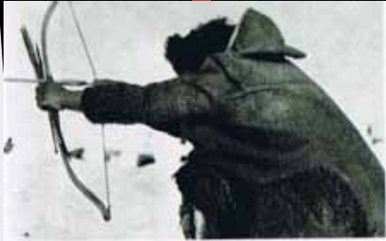
A Nathan Active Mystery